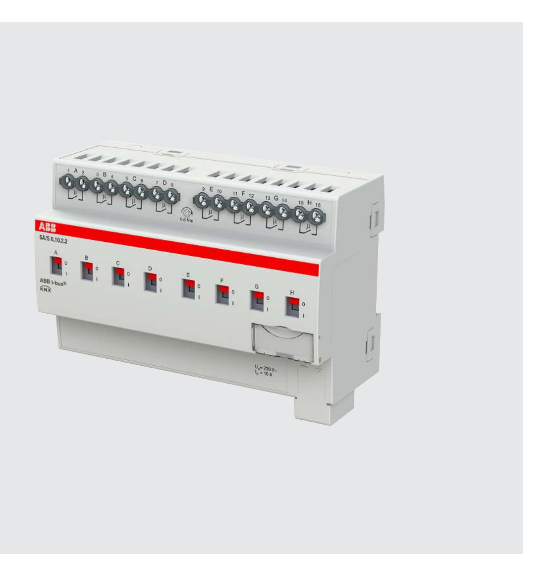
ABB i-bus® KNX SA/S 8.10.2.2 Switch Actuator